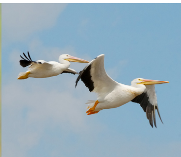
10 Pelecanus erythrorhynchos American White Pelican: Huge white waterbird with black flight feathers. Long yellow bill with extendable pouch.