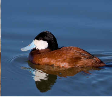
2 Oxyura jamaicensis Ruddy Duck: Scoop-shaped bill, stiff tail often held up. Breeding males have blue bill, chestnut body, white cheeks.