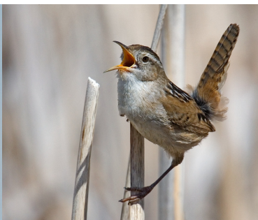
14 Cistothorus palustris Marsh Wren: Rusty brown, cocked tail, black-and-white streaks on back. Gurgling song within marsh vegetation.