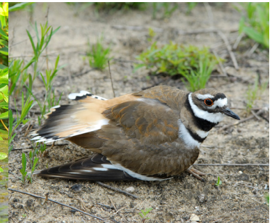
8 Charadrius vociferus Killdeer: Named for call. Brown/white shorebird, 2 black breast bands. Adults do broken-wing display to distract predators.