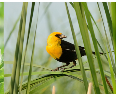
16 Xanthocephalus xanthocephalus Yellow-headed Blackbird: Large blackbird, golden head, white wing patch. Grating song like a rusty gate opening.