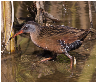
5 Rallus limicola Virginia Rail: Slender bird that walks through marsh. Gray cheeks, reddish bill, black-and-white barring on flanks.