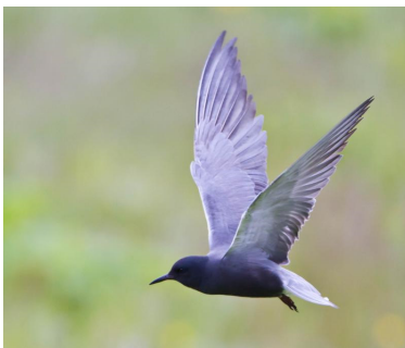
9 Chlidonias niger Black Tern: Small, dark gull-like bird with graceful, buoyant wingbeats. Late-summer birds have mostly-white head.