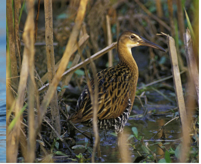
4 Rallus elegans King Rail: Large chickenlike marsh bird. Long down-curved bill. Upperparts mottled brown/rusty, flanks barred white.