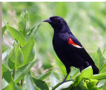
15 Agelaius phoeniceus Red-winged Blackbird: Name descriptive: Males puff out red shoulder patches when singing. Females streaked.