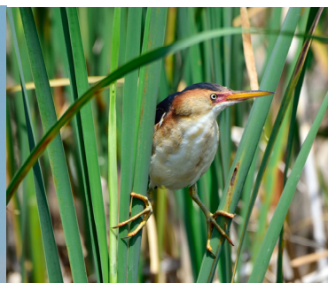
11 Ixobrychus exilis Least Bittern: Tiny heron, conceals very well in vegetation. Hunchbacked, black crown/back, neck striped chestnut.