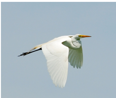
13 Ardea alba Great Egret: Long-legged, elegant wading bird. All white with black legs, S-curved neck, and dagger-like yellow bill.