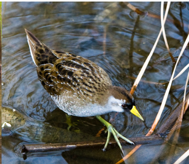
6 Porzana carolina Sora: A common rail, whinny call more often heard than seen. Stubby yellow bill, black mask. Walks with jerking motion.