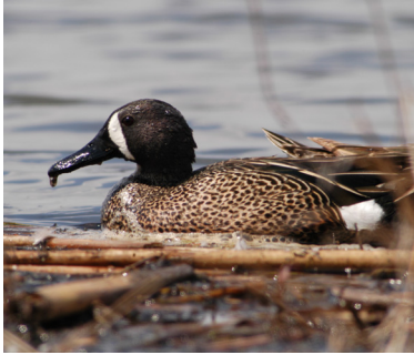
1 Spatula discors Blue-winged Teal: Small dabbling duck. Males have white crescent in front of eye, white near tail; females brown.