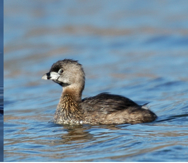
3 Podilymbus podiceps Pied-billed Grebe: Small diving waterbird. Builds nests on floating vegetation. Short, thick two-toned bill.