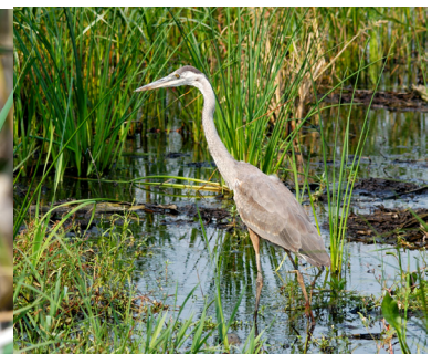
12 Ardea herodias Great Blue Heron: Very large and tall wading bird. Grayish-blue overall, black crown and head plumes on adult.