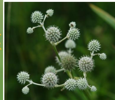
7 Eryngium yuccifolium

Purple prairie clover: Leaflets usually < 2 mm wide. Foliage darker green than that of D. candida .