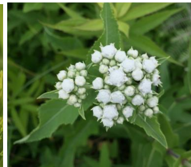
11 Parthenium integrifolium

Pale spiked lobelia: Leaves > 3 mm wide. Flowers blue or white with 2-lobed upper lip and 3-lobed lower lip.