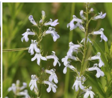
10 Lobelia spicata

Prairie blazingstar: Recurved bracts on flowerheads; compare with appressed bracts of L. spicata .