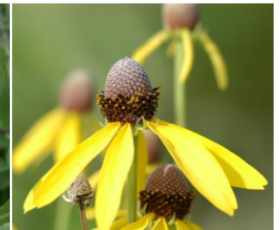
12 Ratibida pinnata

Wild quinine: Greyish green leaves with rough texture. Distinctive flowers resemble cauliflower heads.