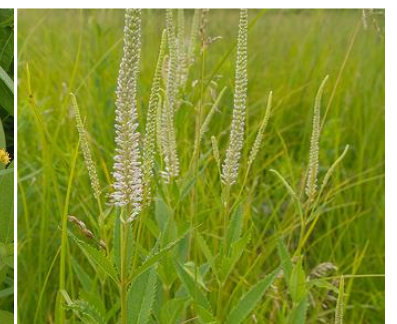
16 Veronicastrum virginicum

Early goldenrod: Stems and leaves hairless, or nearly so. Flower panicles arching. The earliest-blooming goldenrod!