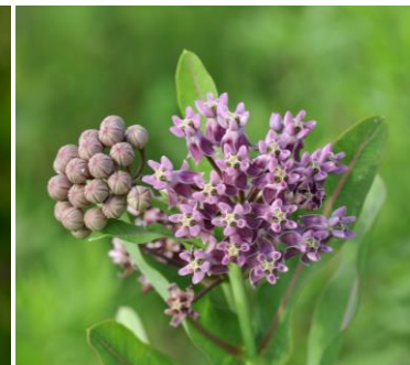
3 Asclepias sullivantii

Nodding onion: Nodding, white to pink flower umbels. Wide, flattened leaves with onion-like scent.