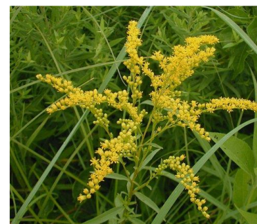
15 Solidago juncea

Compass plant: Rough, deeply lobed leaves. Can grow up to 12' tall when flowering! Leaves tend to orient N-S.