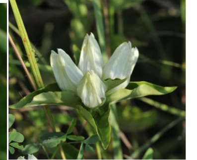
8 Gentiana alba

Rattlesnake master: Blue-green leaves with toothed margins and parallel venation. Prickly flower clusters.