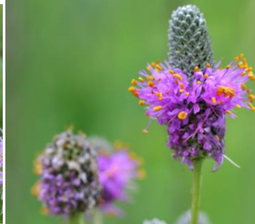
6 Dalea purpurea

Bee balm: Square stems. Grey-green aromatic foliage. Flowers lavender.