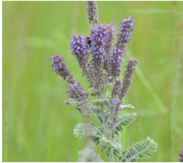
1 Amorpha canescens

Leadplant: Shrub, < 1 m tall. Compound leaves up to 1.5 cm long, greyish-green. Stems and leaves hairy.