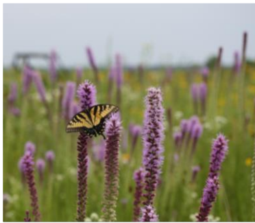
9 Liatris pycnostachya

Cream gentian: Flowers white. Leaves clasping, with smooth margins. Earlier bloom time than other gentians.