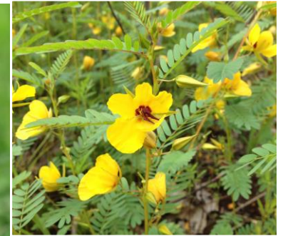
4 Chamaecrista fasciculata

Sullivant's milkweed: Leaves opposite, hairless on underside (compare to A. syriaca ). Flower stalks glabrous.