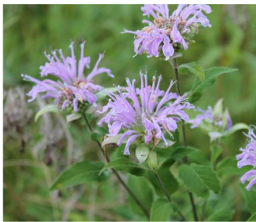
5 Monarda fistulosa

Partridge pea: Pinnately compound leaves, with flowers in axils. Nectararies at base of leaves attract insects.