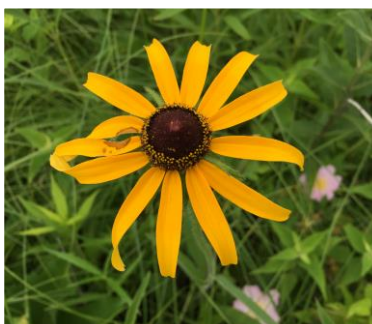
13 Rudbeckia hirta

Yellow coneflower: Drooping yellow ray flowers. Larger leaves pinnately compound.