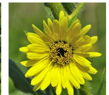
14 Silphium laciniatum

Black-eyed susan: Hairy foliage and stems. Upper stems leafless. Yellow ray flowers and brown disk flowers.