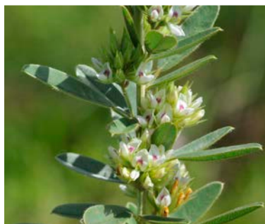
10 Lespedeza capitata

Western sunflower: Central (disc) flowers yellow (compare to H. pauciflorus ). Stems with < 6 pairs of leaves along stem.