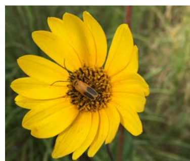
9 Helianthus occidentalis

Flowering spurge: Leaves hairless, alternate; exude milky sap when broken. White floral bracts.