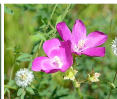
4 Callirhoe triangulata

Whorled milkweed: Narrow (2-3 mm across), whorled leaves are distinct from those of other Asclepias species.