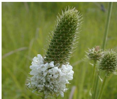
5 Dalea candida

Clustered poppy mallow: Lobes of flowers < 7 mm long. Leaves triangular. Stems w/star-shaped hairs.