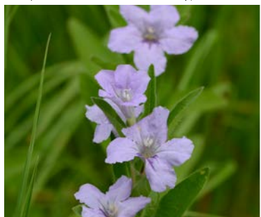
14 Ruellia humilis

Pasture rose: 5-7 leaflets on flowering stems. Twigs and thorns not densely hairy. Thorns straight. Pistil wide and flat.