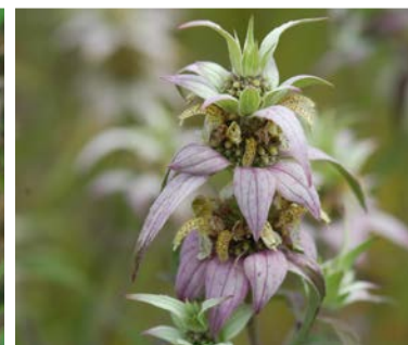
12 Monarda punctata

Cylindrical blazing star: Floral bracts appressed, pointed. Compare to L. aspera .