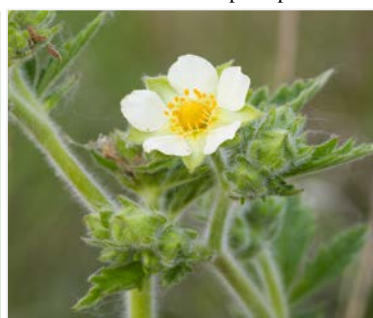
7 Drymocallis arguta

Purple prairie clover: Leaflets usually < 2 mm wide. Foliage darker green than that of D. candida .