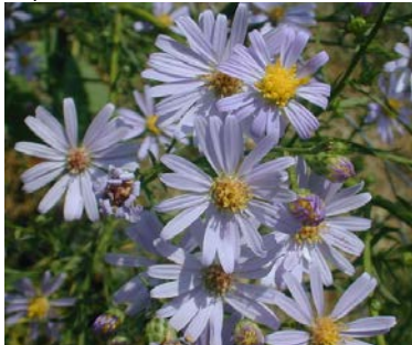
15 Symphyotrichum oolentangiense

Prairie petunia: Stems hairy; leaves opposite and sessile.