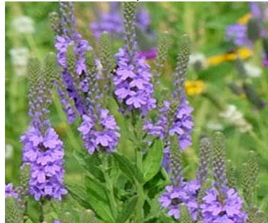
16 Verbena stricta

Sky blue aster: Leaf margins entire; leaves petiolate along lower stem.