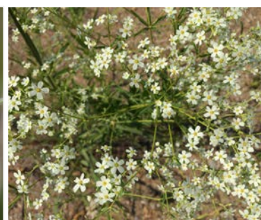
8 Euphorbia corollata

Prairie cinquefoil: Usually > 5 leaflets per leaf; pinnately compound; not silvery beneath. Stems w/ spreading hairs.