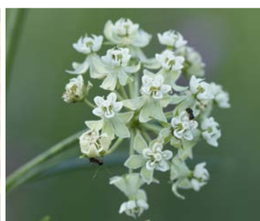
3 Asclepias verticillata

Butterfly weed: Leaves alternate (compare to other Asclepias spp.). Plants do not have milky latex.