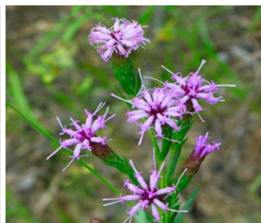
11 Liatriis cylindracea

Round-headed bush clover: Flowers sessile. Leaves hairy - can appear silky. More than 2.5 times long as wide