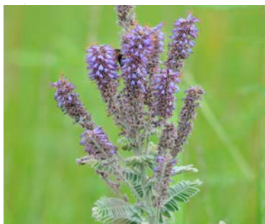
1 Amorpha canescens

Lead plant: Shrub, < 1 m tall. Compound leaves up to 1.5 cm long, greyish-green. Stems and leaves hairy.