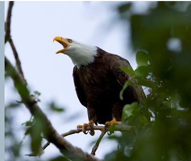
7 Haliaeetus leucocephalus Bald Eagle: Regal adults unmistakable with dark-brown body, all-white heads. Juveniles mottled brown, just as large.