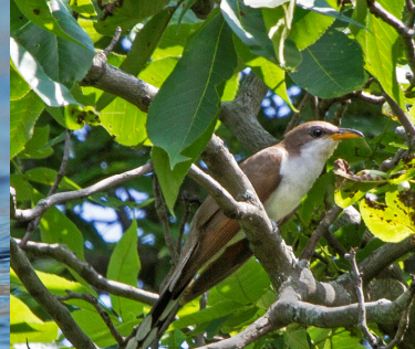
3 Coccyzus americanus Yellow-billed Cuckoo: Slender, long-tailed bird. Bold white spots on tail's underside. Often sits concealed in trees.