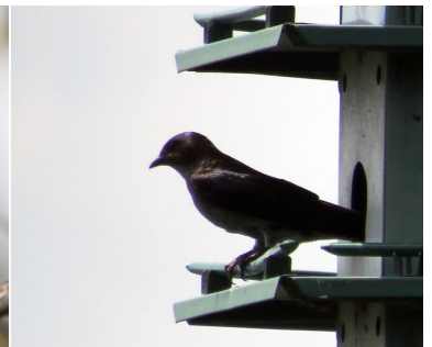
12 Progne subis Purple Martin: Large swallow. Males are dark blue-purple overall. Females/immatures (pictured) browner.