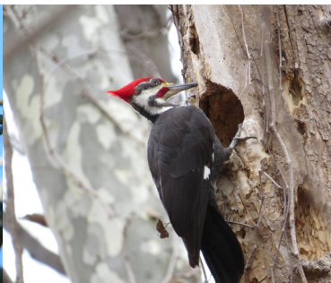
10 Dryocopus pileatus Pileated Woodpecker: Very large woodpecker with red crest, black-and-white on face. Loud flicker-like call.