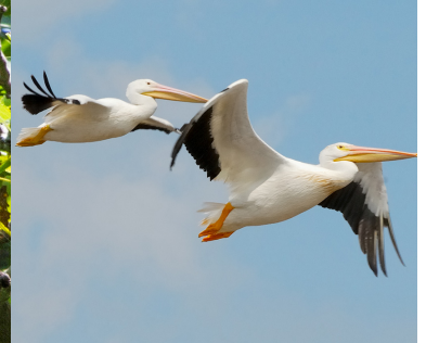
4 Pelecanus erythrorhynchos American White Pelican: Huge white waterbird with black flight feathers. Long yellow bill with extendable pouch.