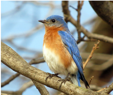
13 Sialia sialis Eastern Bluebird: Males bright sky-blue above, rusty orange on breast. Female duskiest/grayer. Sits on low, open perches.