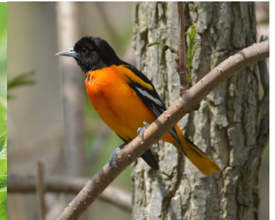
16 Icterus galbula Baltimore Oriole: Males bright orange-and-black, females yellow-orange. Chatter call, loud song heard from treetops.