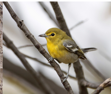
11 Vireo flavifrons Yellow-throated Vireo: Small, chunky songbird with thick bill, yellow "spectacles." Song a burry "three-eight."