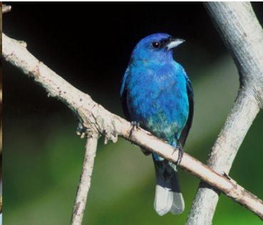
14 Passerina cyanea Indigo Bunting: Males brilliant blue in sunlight, females drab brown. Often found singing at wooded edges.