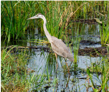
5 Ardea herodias Great Blue Heron: Very large and tall wading bird. Grayish-blue overall, black crown and head plumes on adult.