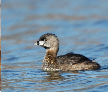
2 Podilymbus podiceps Pied-billed Grebe: Small diving waterbird. Builds nests on floating vegetation. Short, thick two-toned bill.