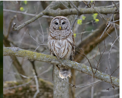
8 Strix varia Barred Owl: Mottled brown on upperparts, buffy below with dark streaks. Dark eyes. Sometimes active in daytime.