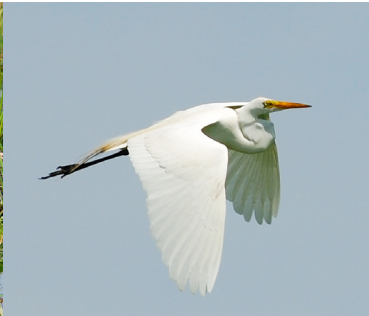
6 Ardea alba Great Egret: Long-legged, elegant wading bird. All white with black legs, S-curved neck, and dagger-like yellow bill.